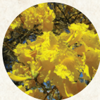
Yellow Trumpet Tree