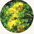
Gold Medallion Tree