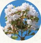
Natchez Crape Myrtle