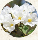
White Geiger Tree