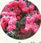
Tuscarora Crape Myrtle