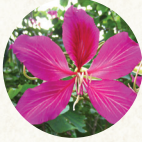
Hong Kong Orchid Tree