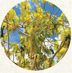
Golden Shower Tree