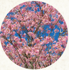
Pink Trumpet Tree