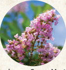
Muskogee Crape Myrtle